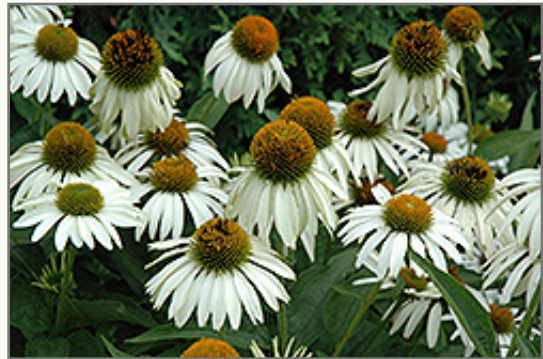
White Swan Coneflower flowers

White Swan Coneflower is an herbaceous perennial with an upright spreading habit of growth. Its medium texture blends into the garden, but can always be balanced by a couple of finer or coarser plants for an effective composition.