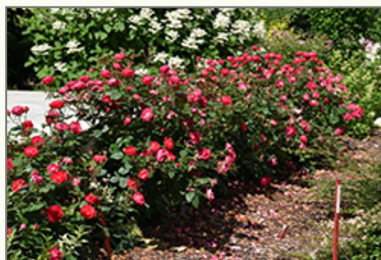
Oso Easy Double Red® Shrub Rose in bloom