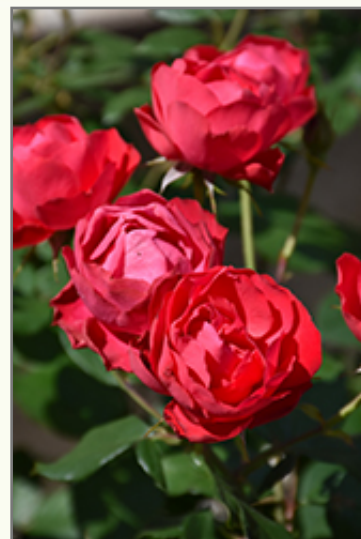
Oso Easy Double Red® Shrub Rose flowers

Oso Easy Double Red® Shrub Rose is recommended for the following landscape applications;