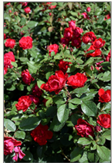
Oso Easy Double Red® Shrub Rose flowers