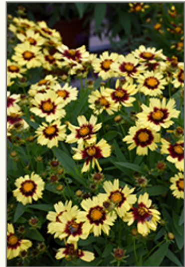
UpTick Yellow and Red Tickseed flowers