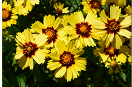
UpTick Yellow and Red Tickseed flowers

This is a relatively low maintenance plant, and is best cleaned up in early spring before it resumes active growth for the season. It is a good choice for attracting bees and butterflies to your yard, but is not particularly attractive to deer who tend to leave it alone in favor of tastier treats. It has no significant negative characteristics.