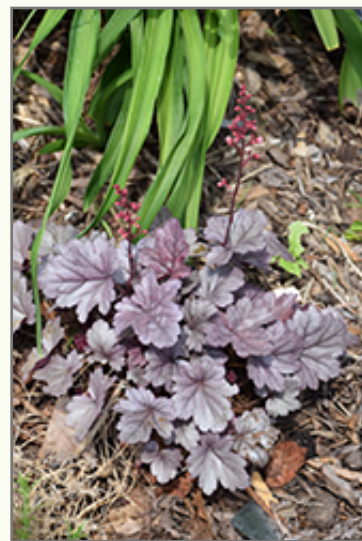
Dolce Silver Gumdrop Coral Bells in bloom

Dolce Silver Gumdrop Coral Bells is a fine choice for the garden, but it is also a good selection for planting in outdoor pots and containers. With its upright habit of growth, it is best suited for use as a 'thriller' in the 'spiller-thriller-filler' container combination; plant it near the center of the pot, surrounded by smaller plants and those that spill over the edges. Note that when growing plants in outdoor containers and baskets, they may require more frequent waterings than they would in the yard or garden. Be aware that in our climate, most plants cannot be expected to survive the winter if left in containers outdoors, and this plant is no exception. Contact our experts for more information on how to protect it over the winter months.