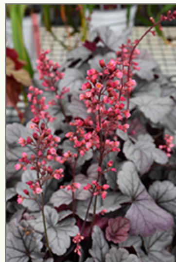
Dolce Silver Gumdrop Coral Bells flowers

Dolce Silver Gumdrop Coral Bells is a dense herbaceous evergreen perennial with tall flower stalks held atop a low mound of foliage. Its relatively fine texture sets it apart from other garden plants with less refined foliage.