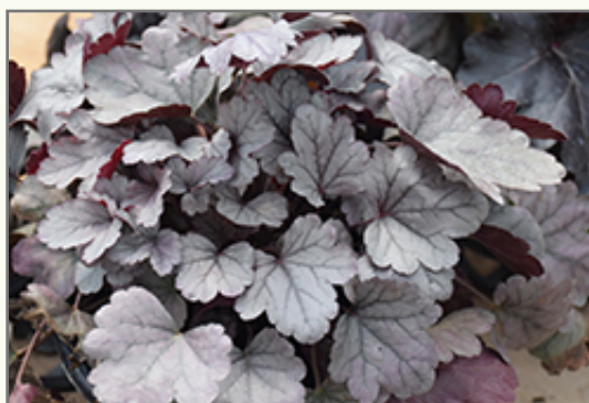
Dolce Silver Gumdrop Coral Bells foliage