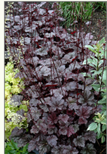
Plum Pudding Coral Bells in bloom