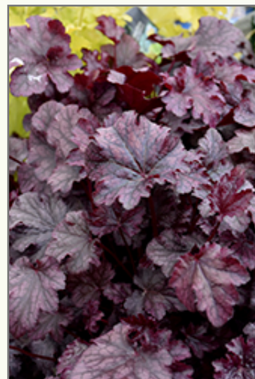
Plum Pudding Coral Bells foliage

Plum Pudding Coral Bells is recommended for the following landscape applications;