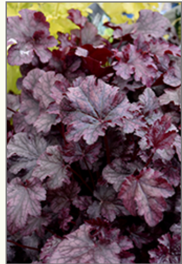
Plum Pudding Coral Bells foliage

Plum Pudding Coral Bells is recommended for the following landscape applications;