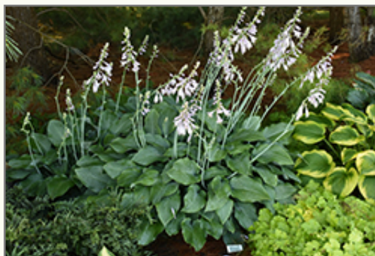
Krossa Regal Hosta in bloom

Krossa Regal Hosta will grow to be about 3 feet tall at maturity extending to 4 feet tall with the flowers, with a spread of 4 feet. When grown in masses or used as a bedding plant, individual plants should be spaced approximately 4 feet apart. Its foliage tends to remain dense right to the ground, not requiring facer plants in front. It grows at a medium rate, and under ideal conditions can be expected to live for approximately 10 years. As an herbaceous perennial, this plant will usually die back to the crown each winter, and will regrow from the base each spring. Be careful not to disturb the crown in late winter when it may not be readily seen!