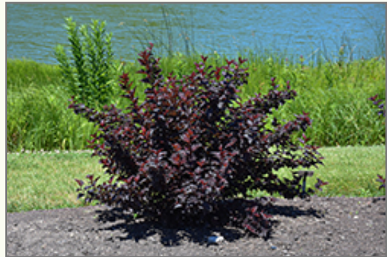
First Editions® Fireside® Ninebark

This shrub will require occasional maintenance and upkeep, and can be pruned at anytime. It has no significant negative characteristics.