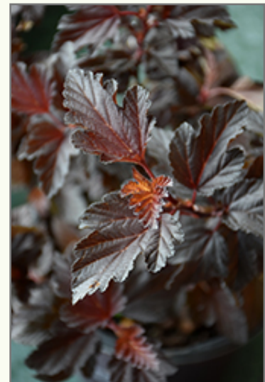
First Editions® Fireside® Ninebark flowers