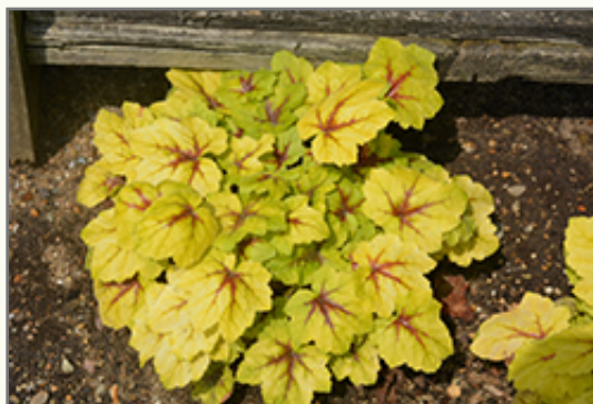
Catching Fire Foamy Bells

Catching Fire Foamy Bells is a dense herbaceous evergreen perennial with tall flower stalks held atop a low mound of foliage. Its medium texture blends into the garden, but can always be balanced by a couple of finer or coarser plants for an effective composition.