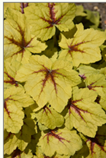
Catching Fire Foamy Bells foliage