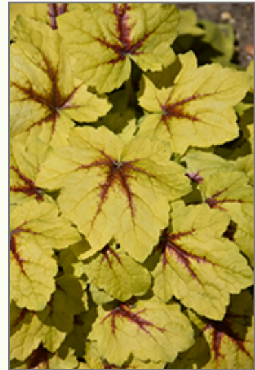
Catching Fire Foamy Bells foliage

Catching Fire Foamy Bells is a dense herbaceous evergreen perennial with tall flower stalks held atop a low mound of foliage. Its medium texture blends into the garden, but can always be balanced by a couple of finer or coarser plants for an effective composition.