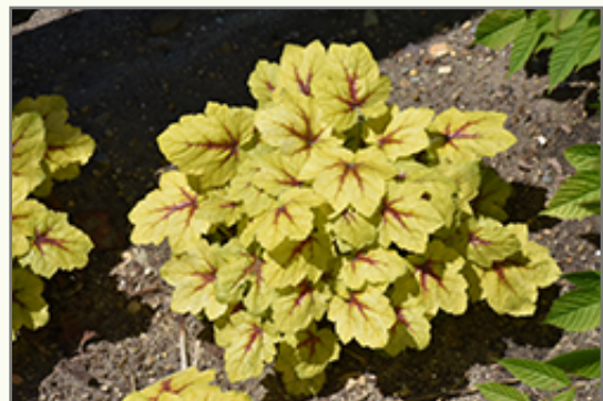
Catching Fire Foamy Bells