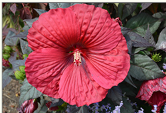
Summerific Holy Grail Hibiscus flowers

This plant will require occasional maintenance and upkeep, and should be cut back in late fall in preparation for winter. It is a good choice for attracting butterflies and hummingbirds to your yard. Gardeners should be aware of the following characteristic(s) that may warrant special consideration;