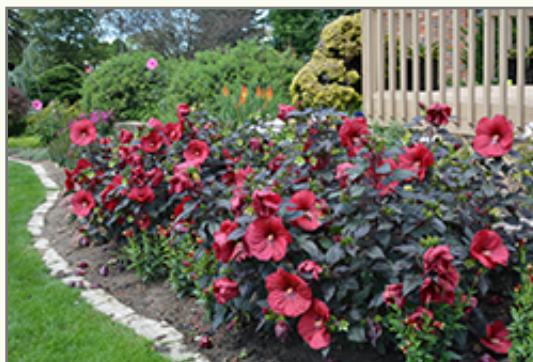
Summerific Holy Grail Hibiscus in bloom