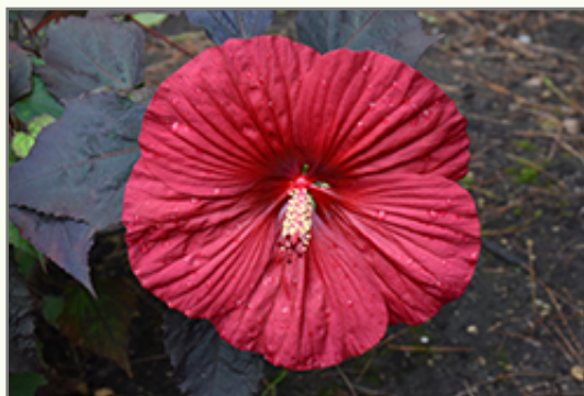
Summerific Holy Grail Hibiscus flowers

Summerific Holy Grail Hibiscus is an herbaceous perennial with an upright spreading habit of growth. Its relatively coarse texture can be used to stand it apart from other garden plants with finer foliage.