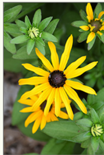
Deamii Black Eyed Susan flowers

Deamii Black Eyed Susan is a fine choice for the garden, but it is also a good selection for planting in outdoor pots and containers. With its upright habit of growth, it is best suited for use as a 'thriller' in the 'spiller-thriller-filler' container combination; plant it near the center of the pot, surrounded by smaller plants and those that spill over the edges. It is even sizeable enough that it can be grown alone in a suitable container. Note that when growing plants in outdoor containers and baskets, they may require more frequent waterings than they would in the yard or garden. Be aware that in our climate, most plants cannot be expected to survive the winter if left in containers outdoors, and this plant is no exception. Contact our experts for more information on how to protect it over the winter months.