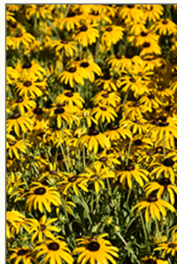
American Gold Rush Black Eyed Susan flowers

American Gold Rush Black Eyed Susan is a fine choice for the garden, but it is also a good selection for planting in outdoor pots and containers. With its upright habit of growth, it is best suited for use as a 'thriller' in the 'spiller-thriller-filler' container combination; plant it near the center of the pot, surrounded by smaller plants and those that spill over the edges. Note that when growing plants in outdoor containers and baskets, they may require more frequent waterings than they would in the yard or garden. Be aware that in our climate, most plants cannot be expected to survive the winter if left in containers outdoors, and this plant is no exception. Contact our experts for more information on how to protect it over the winter months.