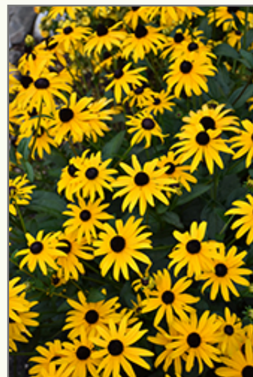
American Gold Rush Black Eyed Susan flowers

American Gold Rush Black Eyed Susan is an herbaceous perennial with an upright spreading habit of growth. Its medium texture blends into the garden, but can always be balanced by a couple of finer or coarser plants for an effective composition.