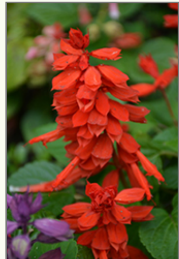
Vista Red Sage flowers