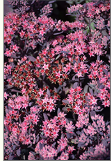
Plum Dazzled Stonecrop flowers

Plum Dazzled Stonecrop is covered in stunning panicles of pink flowers with rose eyes rising above the foliage from late summer to mid fall, which emerge from distinctive dark red flower buds. The flowers are excellent for cutting. Its attractive succulent round leaves emerge bluish-green in spring, turning plum purple in color throughout the season. The burgundy stems are very colorful and add to the overall interest of the plant.