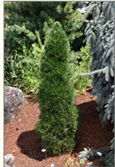
Green Penguin Scotch Pine

Green Penguin Scotch Pine is recommended for the following landscape applications;