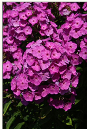
Garden Girls Cover Girl Garden Phlox flowers