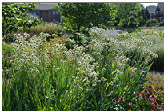
Rattlesnake Master in bloom