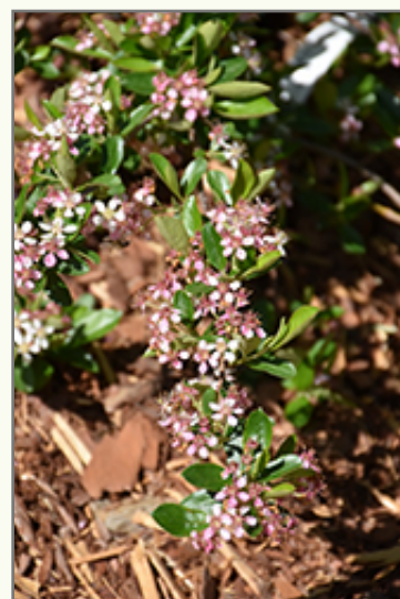
Ground Hug Black Chokeberry flowers