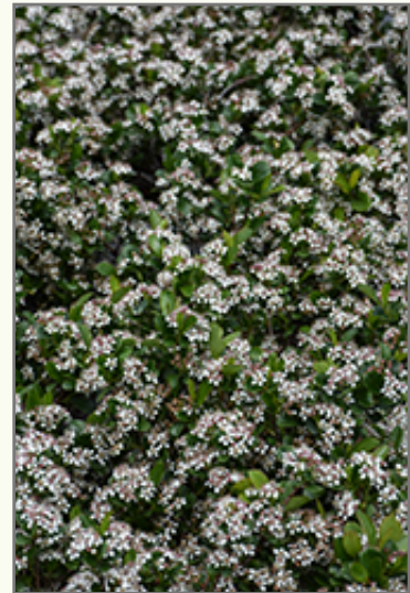
Ground Hug Black Chokeberry flowers