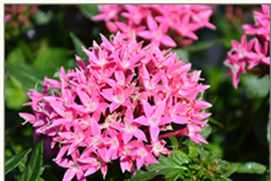
Lucky Star Deep Pink Star Flower flowers