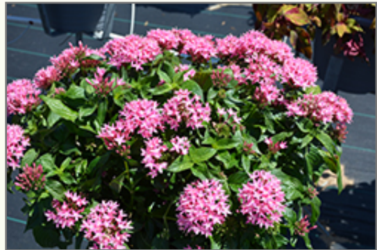
Lucky Star Deep Pink Star Flower in bloom