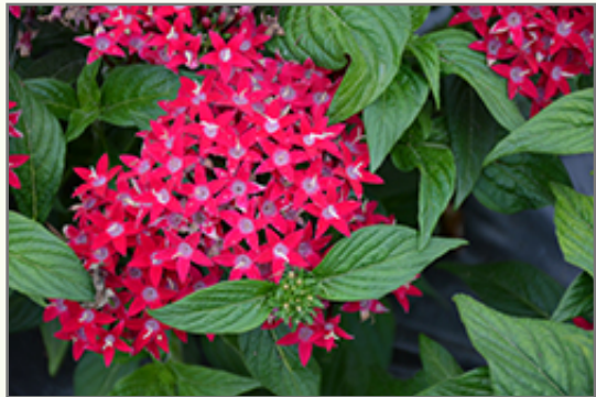
Lucky Star Raspberry Star Flower flowers

Lucky Star Raspberry Star Flower is recommended for the following landscape applications;