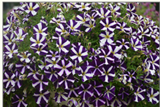
Amore Purple Petunia flowers