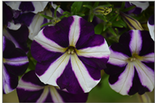
Amore Purple Petunia flowers