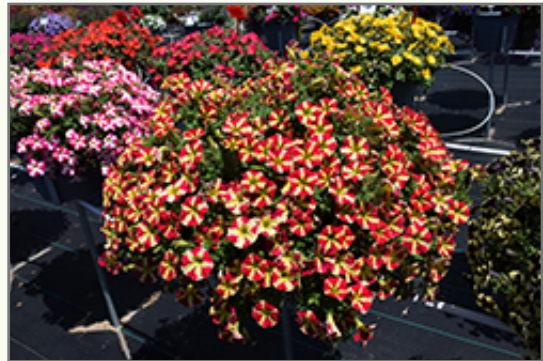
Amore Queen of Hearts Petunia in bloom