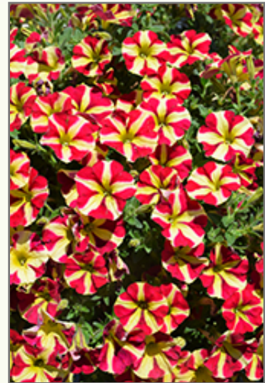
Amore Queen of Hearts Petunia flowers

Amore Queen of Hearts Petunia is a dense herbaceous annual with a mounded form. Its medium texture blends into the garden, but can always be balanced by a couple of finer or coarser plants for an effective composition.