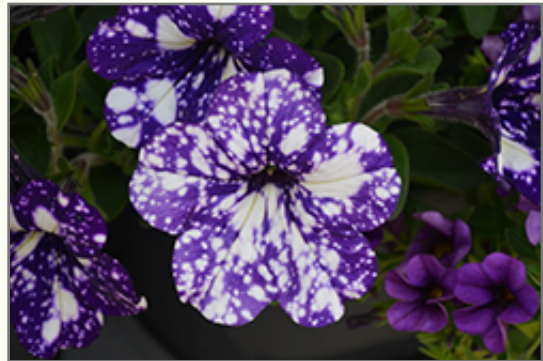
Headliner Night Sky Petunia flowers

Headliner Night Sky Petunia is a dense herbaceous annual with a mounded form. Its medium texture blends into the garden, but can always be balanced by a couple of finer or coarser plants for an effective composition.