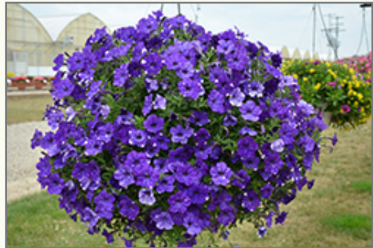
Headliner Night Sky Petunia in bloom