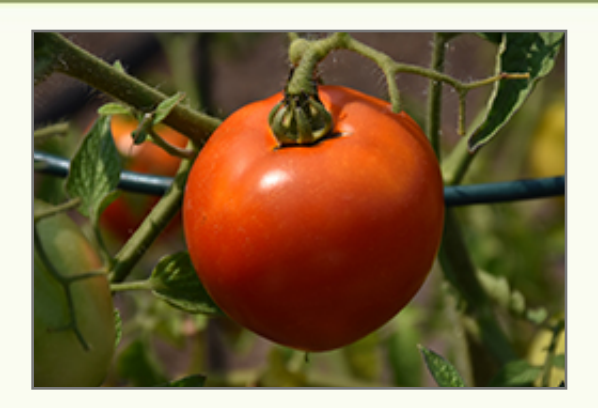
Better Boy Tomato fruit