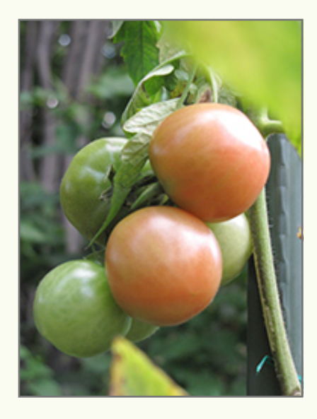
Better Boy Tomato fruit