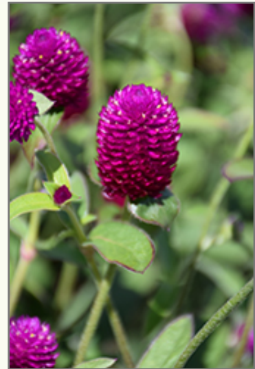
Ping Pong Purple Globe Amaranth flowers

Ping Pong Purple Globe Amaranth is recommended for the following landscape applications;