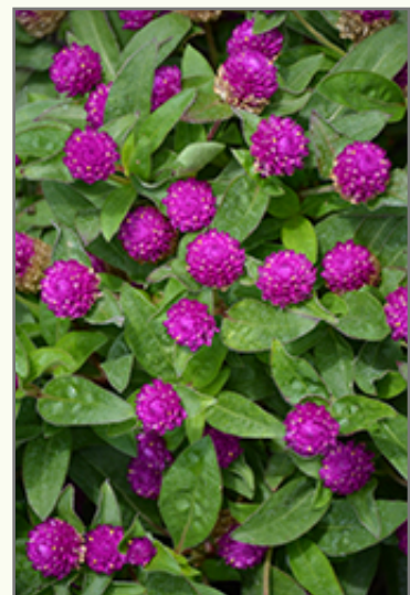
Ping Pong Purple Globe Amaranth flowers