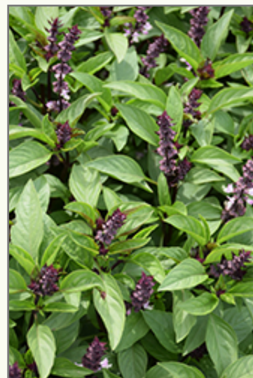
Sweet Basil flowers

This plant is typically grown in a designated herb garden. It should only be grown in full sunlight. It prefers to grow in average to moist conditions, and shouldn't be allowed to dry out. It is not particular as to soil type or pH. It is somewhat tolerant of urban pollution. This species is not originally from North America.