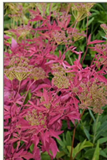
Golden Alexanders in fall