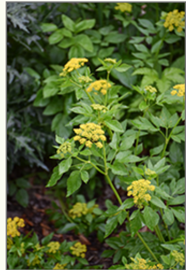
Golden Alexanders flowers