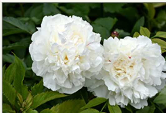
Duchess de Nemours Peony flowers