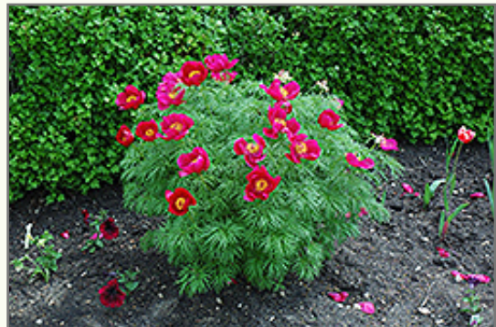
Fernleaf Peony in bloom