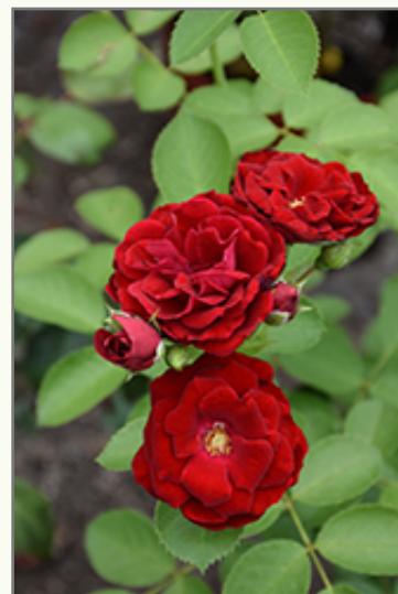
Cherry Frost Rose flowers