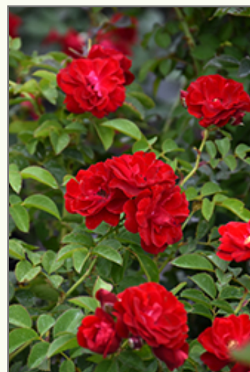
Cherry Frost Rose flowers