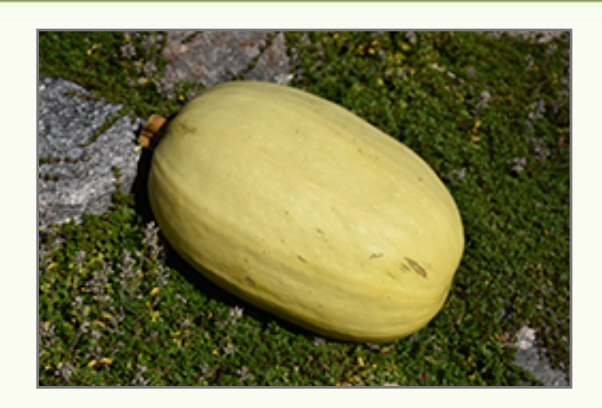
Vegetable Spaghetti Squash fruit

Height: 24 inches Spread: 7 feet Spacing: 3 feet Sunlight: O Hardiness Zone: (annual) Group/Class: Winter Squash