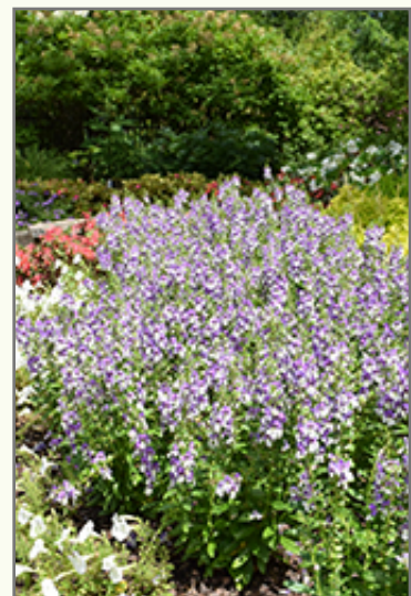
Alonia Big Bicolor Purple Angelonia in bloom