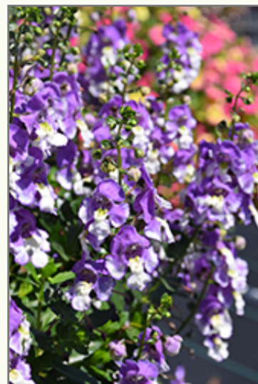
Alonia Big Bicolor Purple Angelonia flowers

Alonia Big Bicolor Purple Angelonia is an herbaceous annual with an upright spreading habit of growth. Its relatively fine texture sets it apart from other garden plants with less refined foliage.