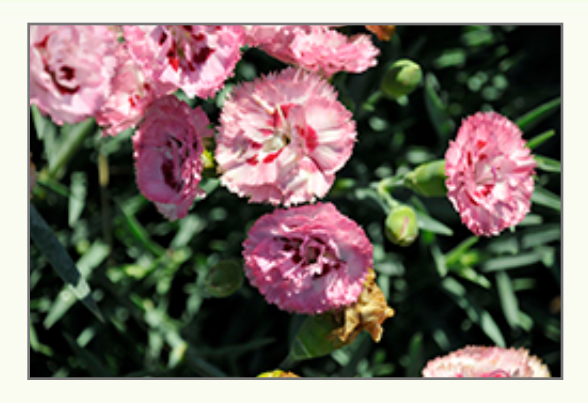
Pretty Poppers Appleblossom Burst Pinks flowers

Height: 10 inches Spread: 16 inches Spacing: 14 inches Sunlight: O Hardiness Zone: (annual) Other Names: Border Pinks, Cheddar Pinks Group/Class: Pretty Poppers Series