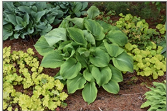
Twin Cities Hosta