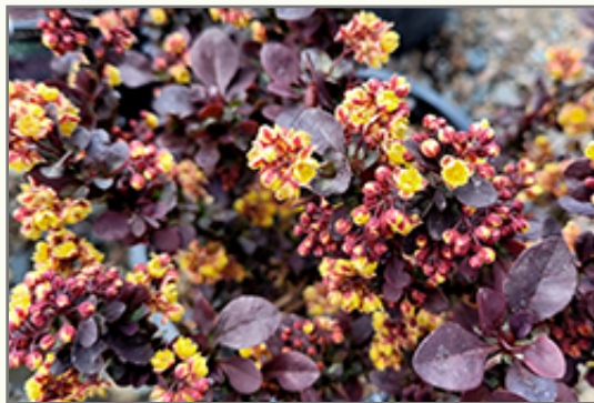
Concord Barberry flowers