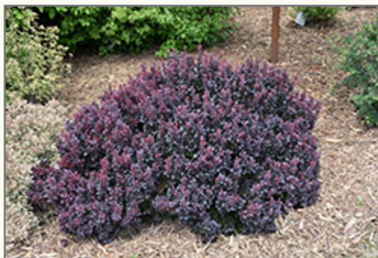
Concord Barberry