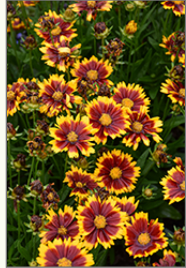
UpTick Red Tickseed flowers

This is a relatively low maintenance plant, and is best cleaned up in early spring before it resumes active growth for the season. It is a good choice for attracting butterflies to your yard, but is not particularly attractive to deer who tend to leave it alone in favor of tastier treats. It has no significant negative characteristics.