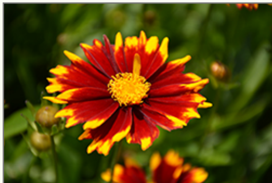
UpTick Red Tickseed flowers

UpTick Red Tickseed will grow to be about 12 inches tall at maturity, with a spread of 14 inches. Its foliage tends to remain dense right to the ground, not requiring facer plants in front. It grows at a medium rate, and under ideal conditions can be expected to live for approximately 10 years. As an herbaceous perennial, this plant will usually die back to the crown each winter, and will regrow from the base each spring. Be careful not to disturb the crown in late winter when it may not be readily seen!