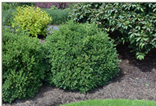
Green Velvet® Boxwood

Green Velvet® Boxwood is recommended for the following landscape applications;