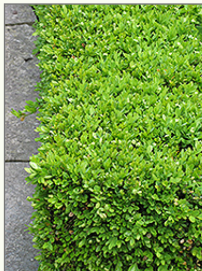
Green Velvet® Boxwood foliage