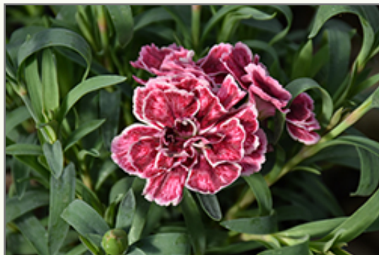
Constant Beauty Crush Burgundy Pinks flowers

Constant Beauty Crush Burgundy Pinks is an herbaceous evergreen perennial with a mounded form. It brings an extremely fine and delicate texture to the garden composition and should be used to full effect.