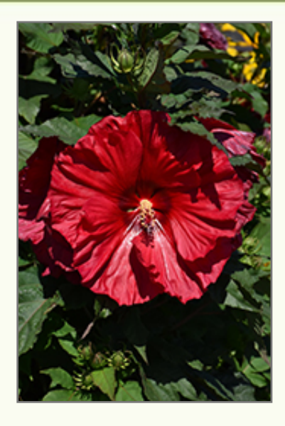
Summerific Valentine's Crush Hibiscus flowers

This bold garden perennial features showy ruffled, large, bright red flowers that are produced at the nodes all up the stems; attractive, glossy, dark-green/bronze leaves; ideal for the mixed garden border or in mass; do not allow to dry to wilting point