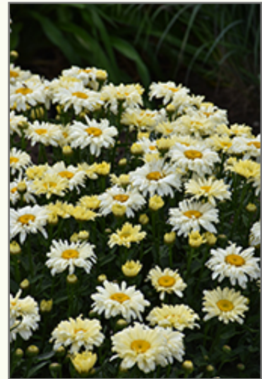
Amazing Daisies Banana Cream II Shasta Daisy flowers