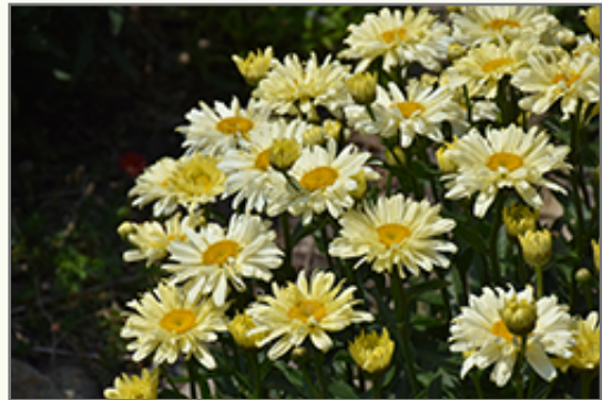
Amazing Daisies Banana Cream II Shasta Daisy flowers

Amazing Daisies Banana Cream II Shasta Daisy is an herbaceous perennial with an upright spreading habit of growth. Its medium texture blends into the garden, but can always be balanced by a couple of finer or coarser plants for an effective composition.