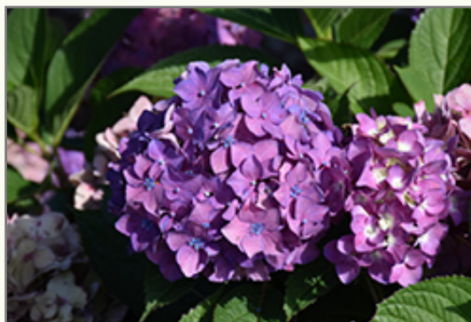
Let's Dance Arriba! Hydrangea flowers

This shrub will require occasional maintenance and upkeep, and should only be pruned after flowering to avoid removing any of the current season's flowers. It has no significant negative characteristics.