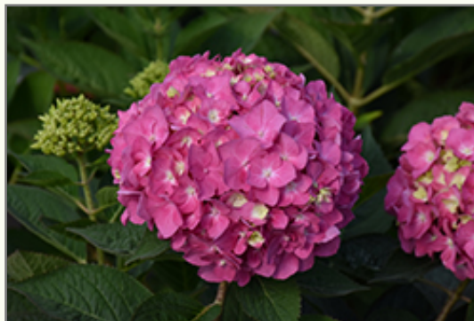
Let's Dance Arriba! Hydrangea flowers