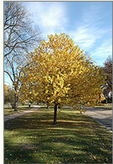
Amur Chokecherry in fall