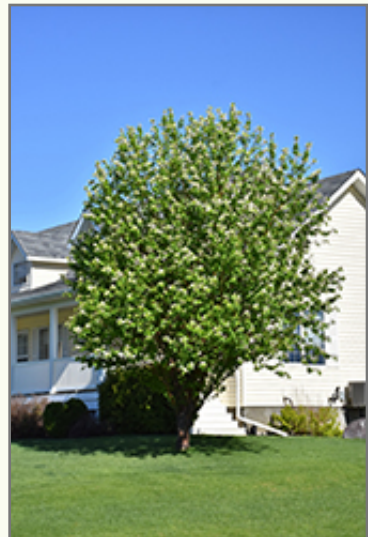
Amur Chokecherry