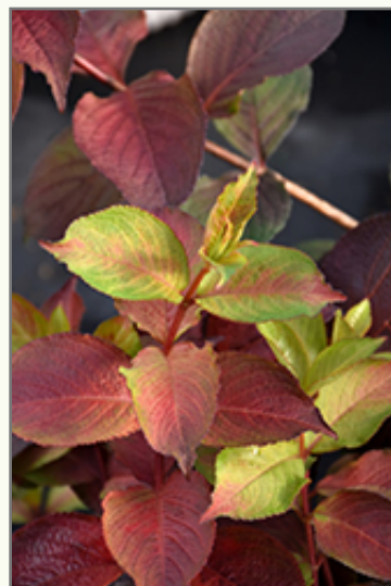
Midnight Sun Reblooming Weigela foliage