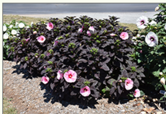
Summerific Edge of Night Hibiscus in bloom