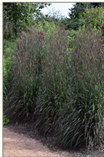
Holy Smoke Bluestem