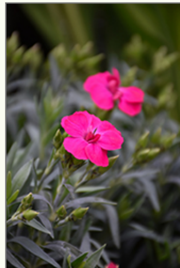
Peman Violet Border Carnation flowers