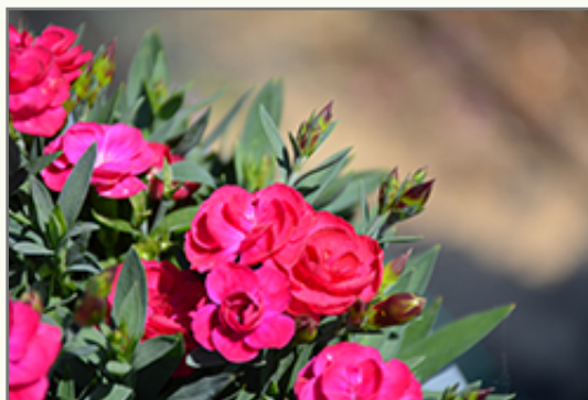
Peman Violet Border Carnation flowers

Peman Violet Border Carnation is an herbaceous evergreen perennial with a mounded form. It brings an extremely fine and delicate texture to the garden composition and should be used to full effect.