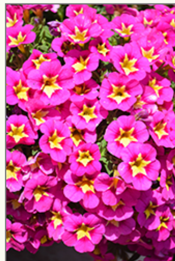
Bumble Bee Hot Pink Calibrachoa flowers

Bumble Bee Hot Pink Calibrachoa is a dense herbaceous annual with a trailing habit of growth, eventually spilling over the edges of hanging baskets and containers. Its medium texture blends into the garden, but can always be balanced by a couple of finer or coarser plants for an effective composition.