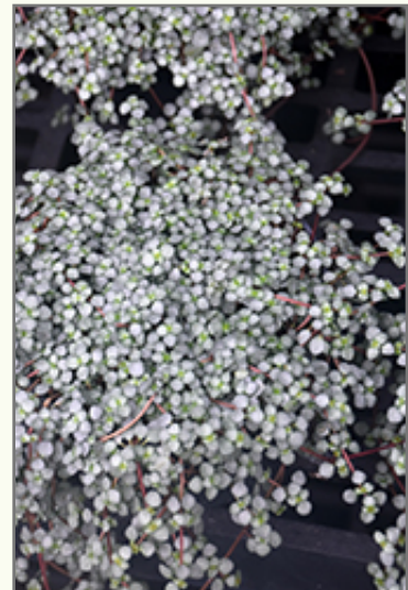
Aquamarine Pilea foliage