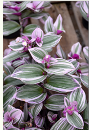
Nanouk Tradescantia foliage

This is an herbaceous evergreen houseplant with a spreading, ground-hugging habit of growth. Its relatively fine texture sets it apart from other indoor plants with less refined foliage. This plant may benefit from an occasional pruning to look its best.