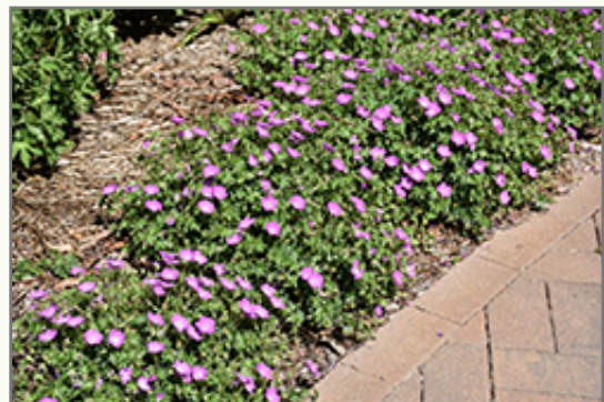
Max Frei Geranium in bloom