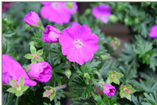
Max Frei Geranium flowers

Max Frei Geranium will grow to be about 12 inches tall at maturity, with a spread of 15 inches. When grown in masses or used as a bedding plant, individual plants should be spaced approximately 10 inches apart. Its foliage tends to remain dense right to the ground, not requiring facer plants in front. It grows at a medium rate, and under ideal conditions can be expected to live for approximately 10 years. As an herbaceous perennial, this plant will usually die back to the crown each winter, and will regrow from the base each spring. Be careful not to disturb the crown in late winter when it may not be readily seen!