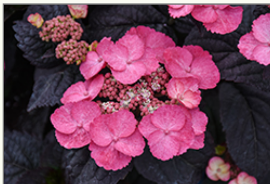
Pink Dynamo Hydrangea flowers

Pink Dynamo Hydrangea is recommended for the following landscape applications;